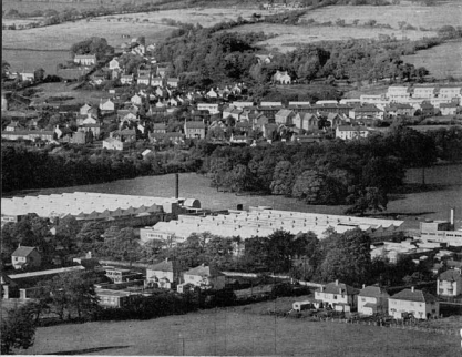
Wind Road and Gurnos, showing the Enfield Clock and the Anglo-Celtic Watch Factories