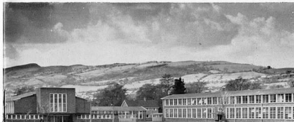
Maes-y-Oderwen Comprehensive School