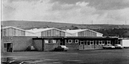
Breconshire Hosiery Co. Ltd. Factory—Crestmont Group

The story of our countryside must rightly start with Cwmtyrch. It is a long, winding village, so long that it has to be known as either the Upper or the Lower. It does not entirely belong to our County. It is shared also by the Counties of Glamorgan and Carmarthen. It