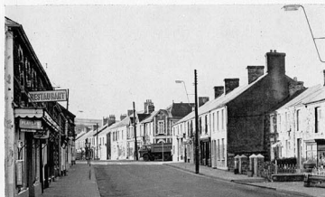
The Cross, Ystradgynlais

keep the chill out. We also derive the benefits of the warmth brought up this splendid valley by the gentle Atlantic winds after parting company with the Gulf Stream.